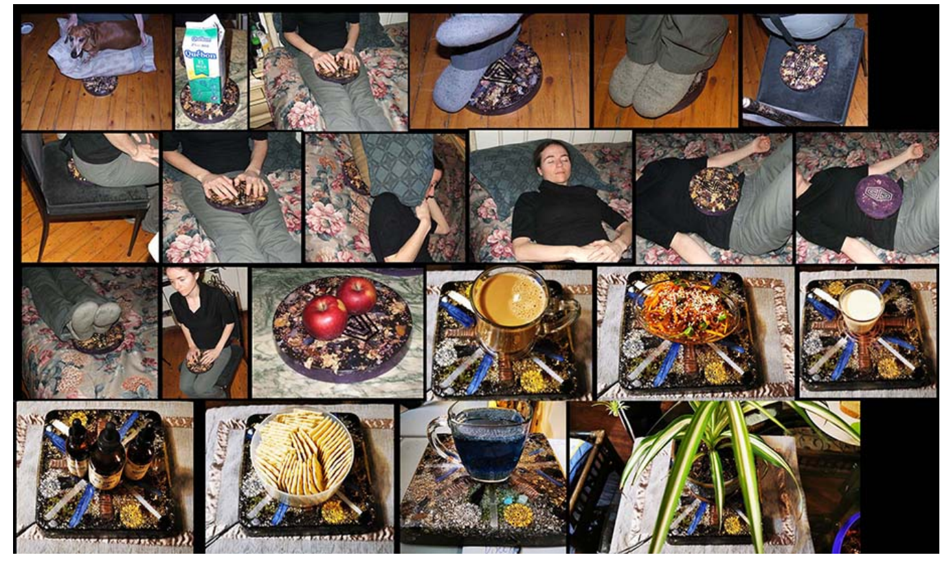
Unique active and exclusive technology of ORGO-LIFE®, amplifier and emanation of vibrations (resonance and energies), waves and Chi Prana (Universal energy):